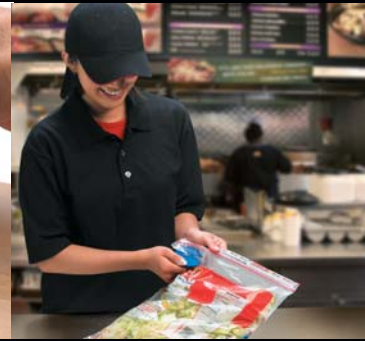
Cut For Resealing